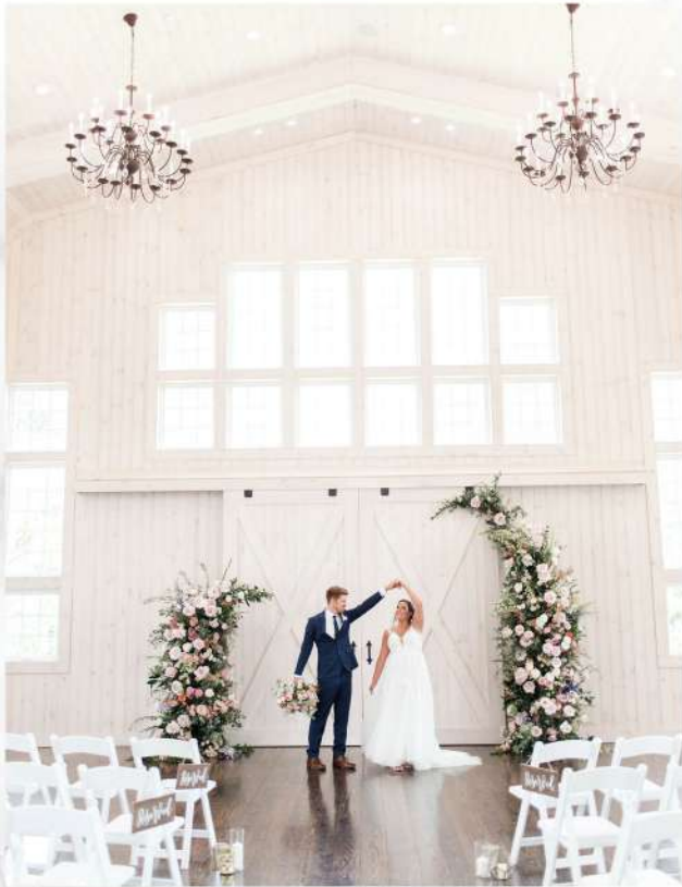
Barn Door Backdrop: 11' wide x 10' tall